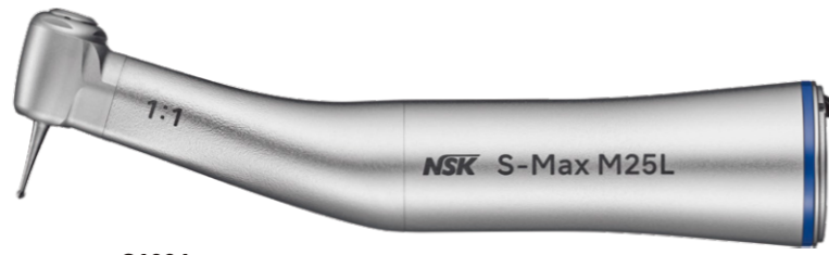
1:1 Direct Drive

OPTIC MODEL: M25L ORDER CODE: C1024 NON-OPTIC MODEL: M25 ORDER CODE: C1027